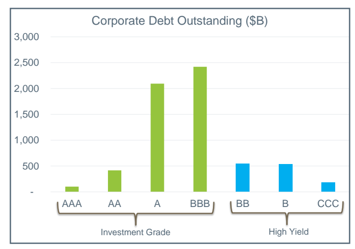
Figure 1: BBB-Rated Corporate Bonds

The proportion of BBB-rated bonds within the Bloomberg Barclays US Corporate Investment Grade Index has steadily grown from 34% to 48% over the last 10 years. The significant size of the BBB-rated corporate bond space as represented in Figure 1 could profoundly affect both investment grade and high yield markets if a wave of downgrades were to occur. Relatedly, in conversations with investment managers over the past few quarters a general trend of de-risking through the rotation out of BBB-rated securities has been observed.