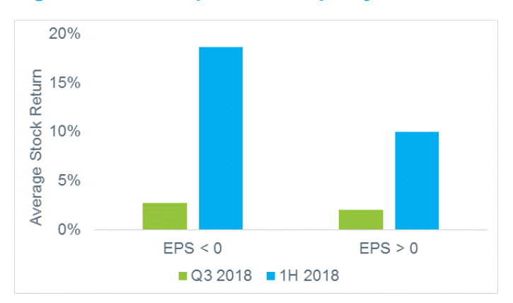
Figure 1: Small Cap Return Disparity

Figure 1 illustrates the impact within the small cap space from stocks with negative earnings per share ("EPS") outpacing stocks with positive EPS during the first half of 2018. This trend weakened in Q3, partially driven by a pause in the rally among small cap biotechnology and software stocks which had been a persistent headwind to active managers in the space.