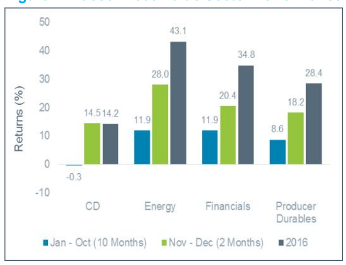
Figure 1: Russell 2000 Value Sector Performance

Figure 1 shows the bifurcation in pre- and postelection results in cyclical and economically-sensitive sectors within the Russell 2000 Value. While producing modestly positive returns through October 2016, these sectors surged post-election.