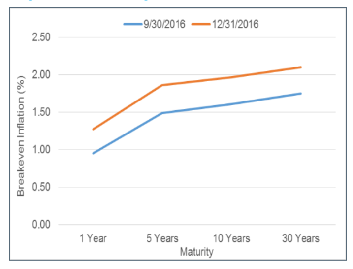
Figure 2: Increasing Inflation Expectations

equity ended the quarter at the approximate midpoint of the group.