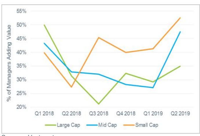
Exhibit 1: US Equity Manager Success Rates

the small- and mid-cap segments experienced improved success rates during the quarter, while active large-cap managers struggled to keep up with the strong benchmark returns. Exhibit 1 illustrates the quarterly trend of active management success rates, net of median asset class fees, in US equity.